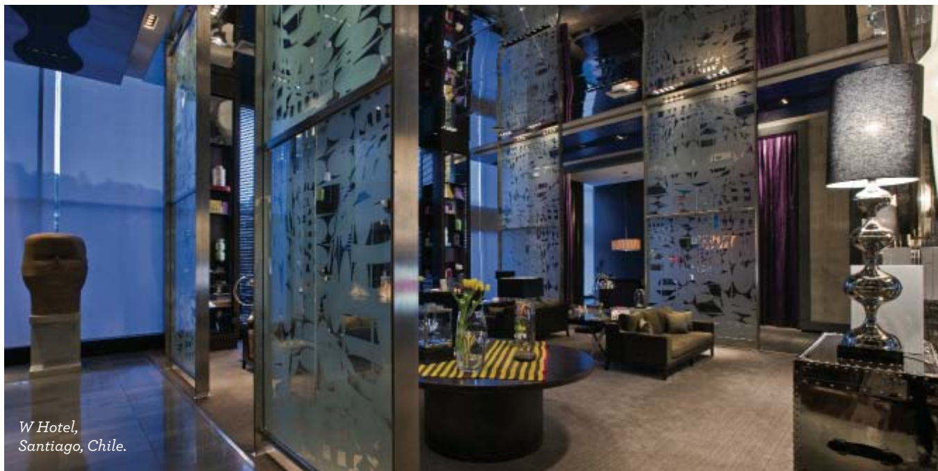
W Hotel, Santiago, Chile.

and Peru, South America has become the new hotspot for developers of high-end designer boutiques, resorts, and villas.