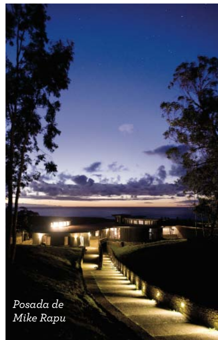
Posada de Mike Rapu

The 2008 opening of this ultrachic designer boutique hotel in such an unexpected location marked the coming of age for luxury travel to South America. For years, the continent's properties lacked the aesthetic pizzazz of more high-profile alternatives: Africa's sumptuous safari camps, Asia's jet-set urban hotels and beach resorts, Europe's courtly manors and country estates. But thanks to a number of red-hot economies, led by Brazil, and successful crackdowns against crime in places like Colombia