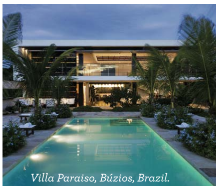
Villa Paraíso, Búzios, Brazil.

On a recent whirlwind trip through Argentina, Chile, and Brazil, I sampled a half-dozen new villas and designer hotels that exemplified this emerging high-end hospital-